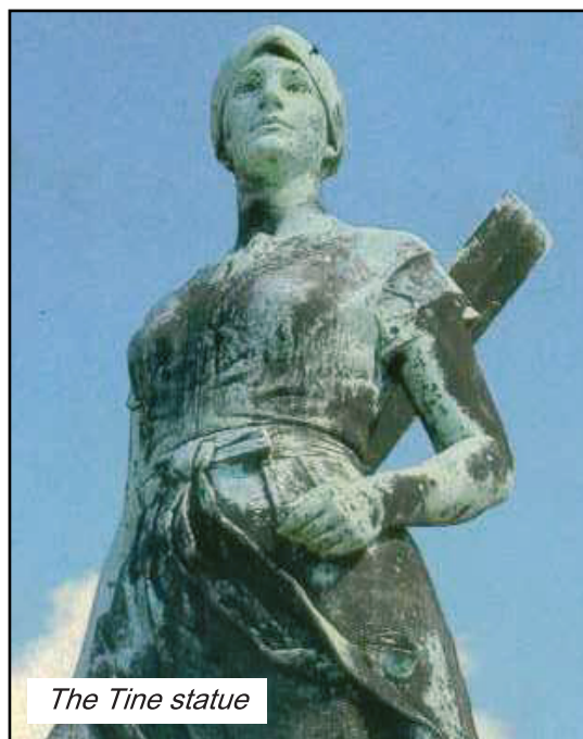
The Tine statue